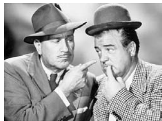
Abbott and Costello (see No. 2) →

3rd Annual RMA Golf Tournament - Rhodes Ranch GC